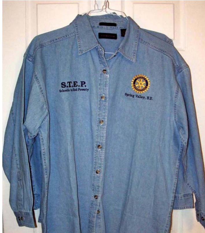
Spring Valley Rotary STEP long sleeve denim shirts for sale. Sizes in stock > women's small, medium, extra large

Rotary Briefcase/bag will hold files and lap top computer