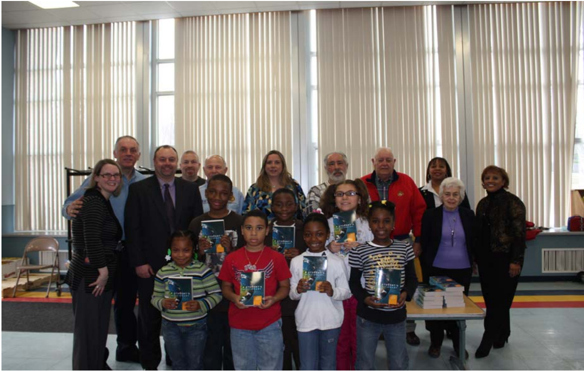
Hempstead Elementary School