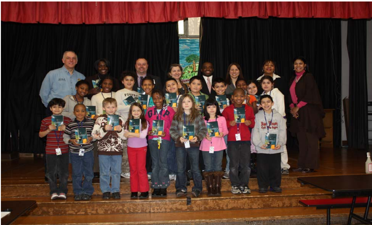
Grandview Elementary School